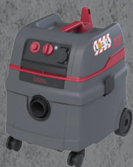
Vacuum Cleaner DS25L 305-00371-000-001