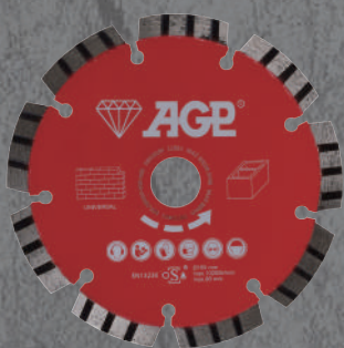
Universal: 150mm Diamond Saw Blade 150 x H10 x T2,6 x 22,23mm 305-00036-000-068