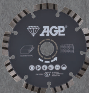
Hard Material: 150mm Diamond Saw Blade 150 x H10 x T2,6 x 22,23mm 305-00036-000-069

Optional quick set-up Guide Rail System provides maximum operator convenience and minimizes human error.