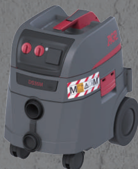
Vacuum Cleaner DS35M 305-00371-000-002